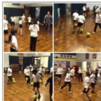
Enjoying Aston Villa Football!

We look forward to more sporting activities next term.