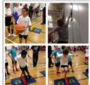
Y5/6 competing in Indoor Athletics

⇒ Participation in a local dance festival, where children were able to