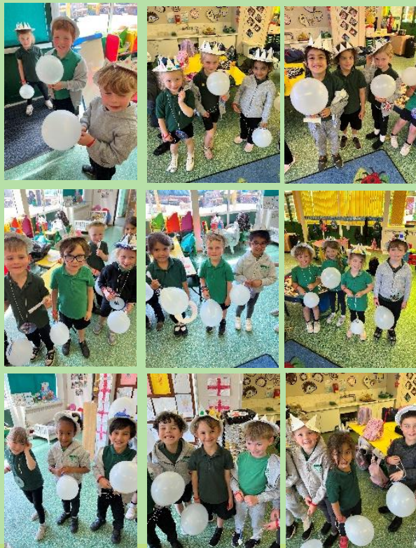
Class of 2022 Reception Platinum Jubilee

On Thursday, the children made their crown in preparation for the Jubilee parade. Using paper plates, the children used a ruler to draw 4 lines, after the teacher made a hole in the middle for the children to start their neat cutting of the lines. Once each line was cut, the children then folded the triangles up to make the beginning of the crown. It was then time to start decorating our crowns.