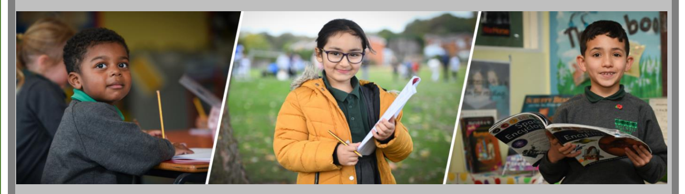
ACE; Ambitious, Curious and Ever-respectful

Kindness, Compassion, and Connection at the heart of 'Our School' Week commencing: Monday 4th March 2024