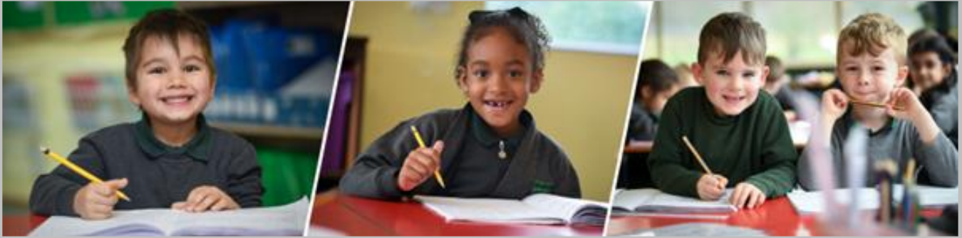
ACE; Ambitious, Curious and Ever-respectful