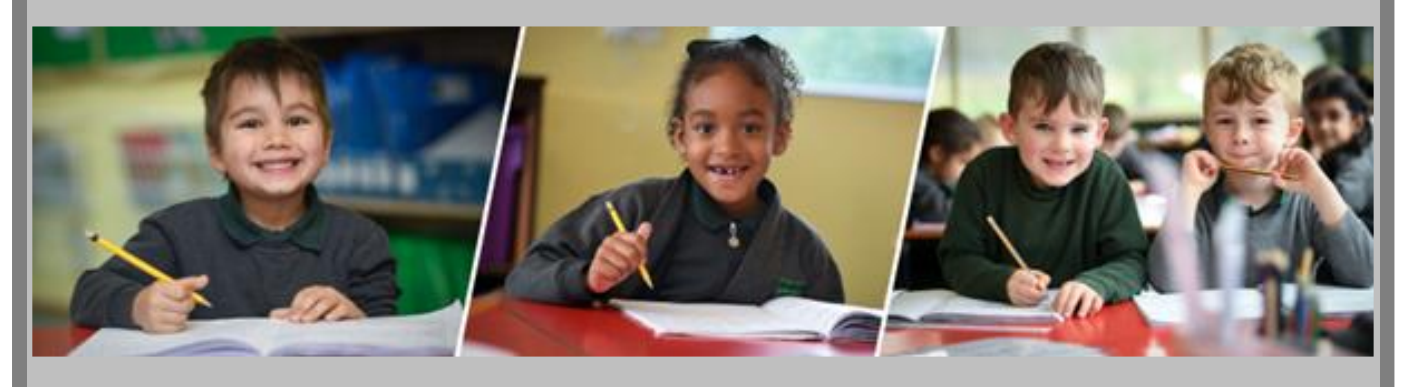
ACE; Ambitious, Curious and Ever-respectful

Kindness, Compassion, and Connection at the heart of 'Our School' Week commencing: Monday 18<sup>th</sup> November