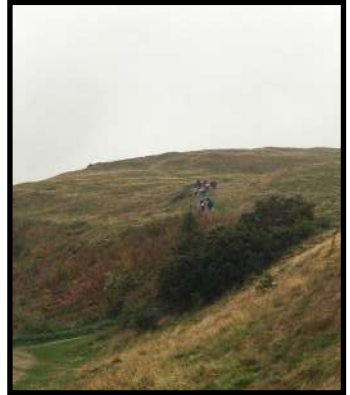
Can you see us?

We're actually walking inside a real cloud!